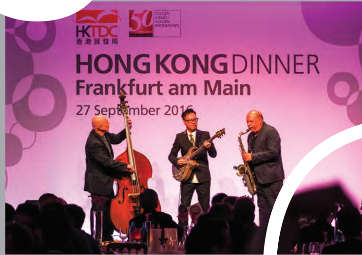
Guest performance at Hong Kong Dinner