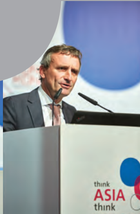
Mr Thomas Geisel, Mayor of Düsseldorf, the State Capital of North Rhine-Westphalia