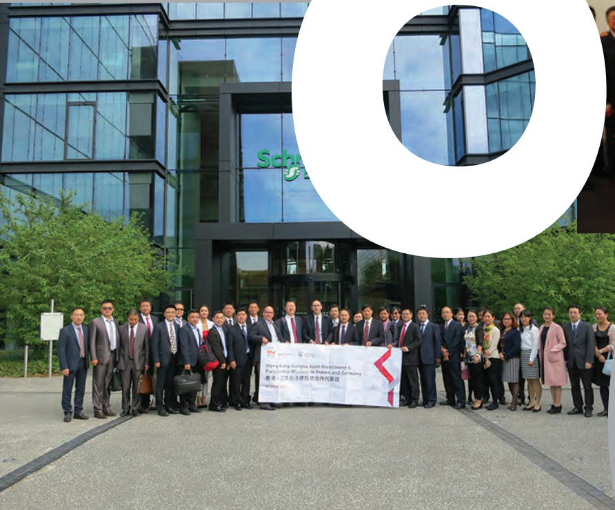
Hong Kong-Jiangsu Joint Investment and Partnership Mission