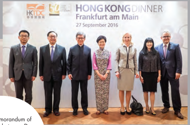
Guests of Honour and VIPs at Hong Kong Dinner