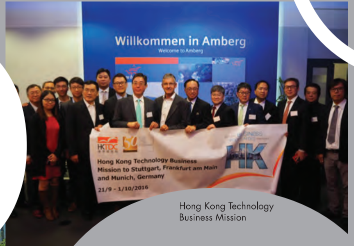
Hong Kong Technology Business Mission