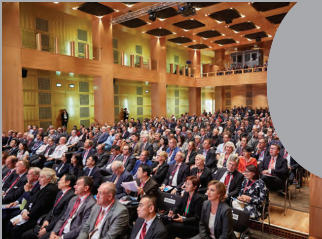
Thematic seminar on "Selling to China and throughout Asia" in Düsseldorf