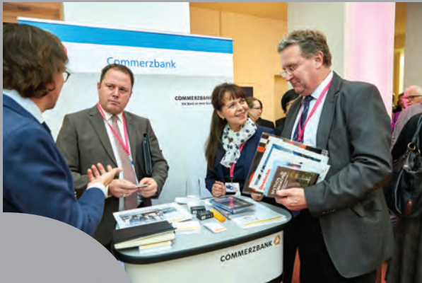
Business matching meetings at "Think Asia, Think Hong Kong"