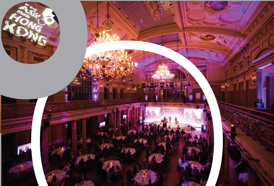
Hong Kong Dinner in Frankfurt